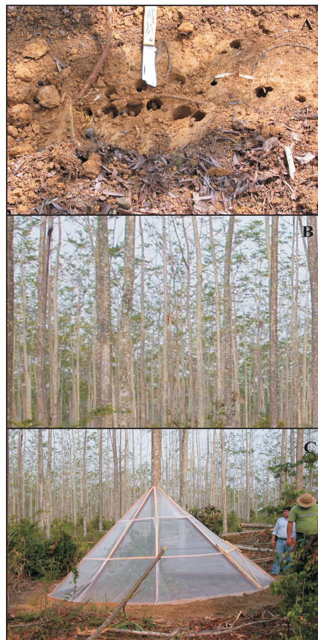
Figure 2. Exit holes of Quesada gigas (A), plants of Schizolobium amazonicum with symptoms of attack by this insect (B) and trap to capture nymphs (C).