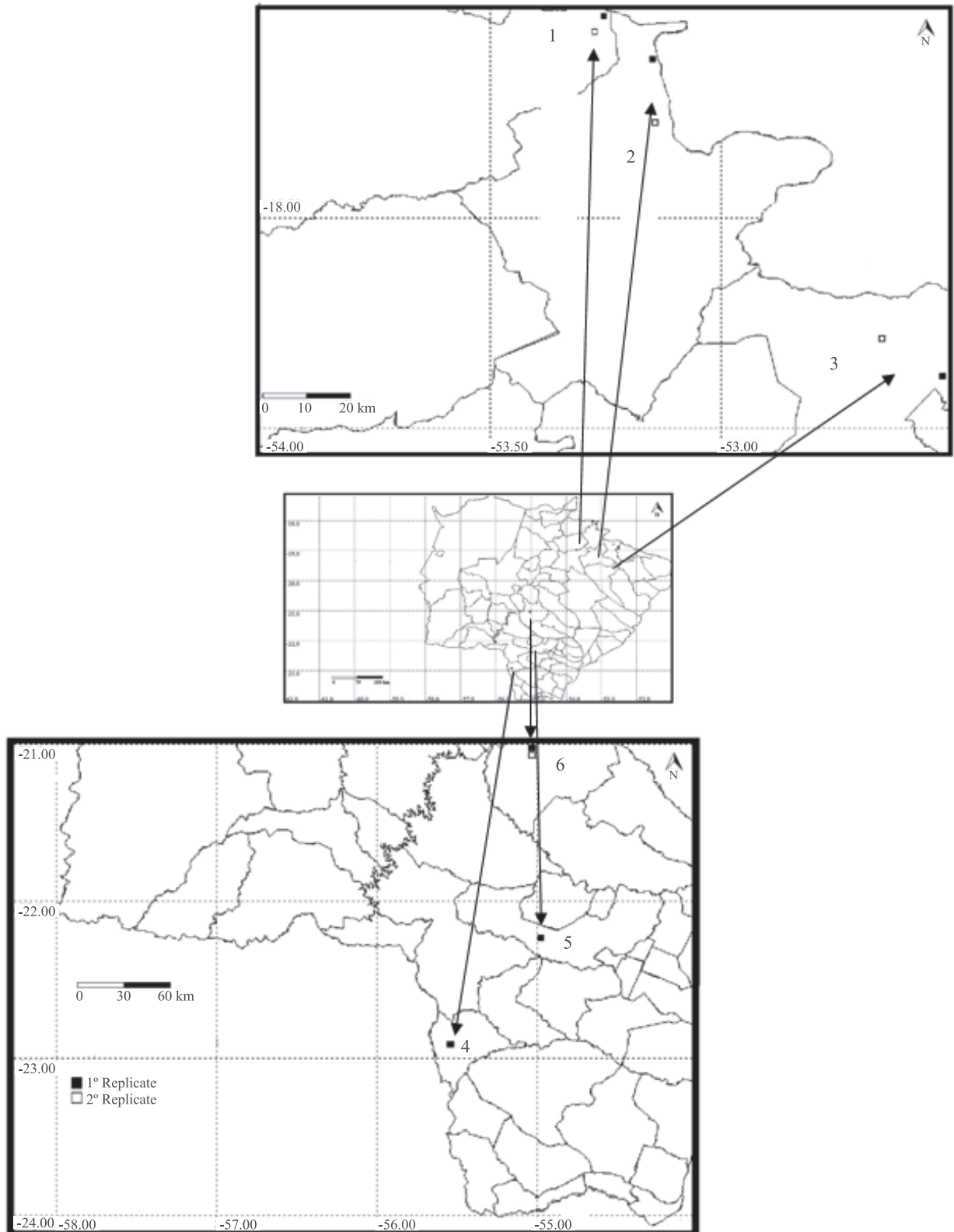
Figure 1. Map of the study areas in the state of Mato Grosso do Sul, Brazil, with the number of experimental replicates in 2015. The municipalities identified in the numerical sequence are: 1, Alcinópolis; 2, Costa Rica; 3, Chapadão do Sul; 4, Aral Moreira; 5, Dourados; and 6, Sidrolândia.