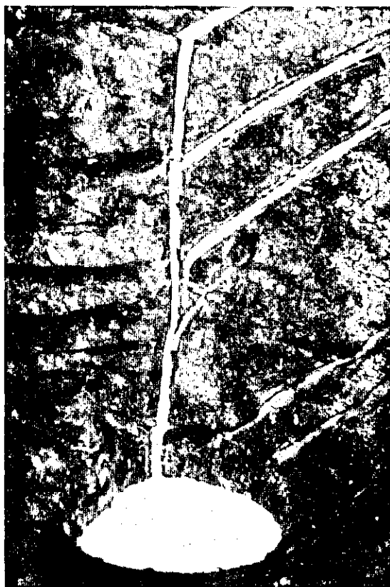
FIG. 4. Hevea brasiliensis with purple bark from Ouro Preto, estimated to be 60 years old.