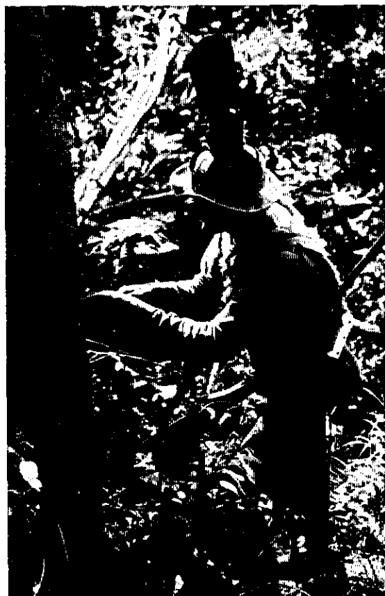
FIG. 1. Native tapper carrying out tapping armed with a rifle and a zerosene head light.

3. Diameter of latex vessels was observed in the transverse section of the bark;