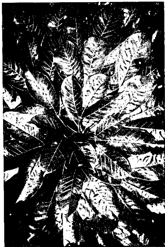
FIG. 2. View of the tree leaves with light incidence of M. ulei .

in the Ouro Preto area of Rondônia Territory of Brazil (Figure 3).