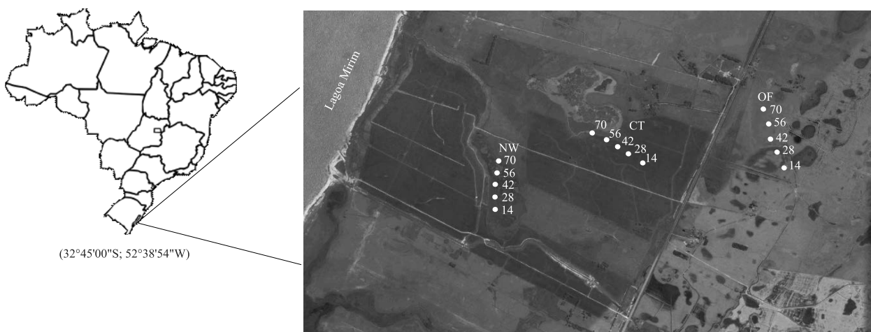
Figure 1. Map of the experimental sites in Santa Vitória do Palmar, state of Rio Grande do Sul, Brazil: NW, natural wetland area; CT, conventional systems; and OF, organic systems, and the points from which five units were sampled, in each site, are described according to the collecting day after the incubation, at 14, 28, 42, 56, and 70 days.